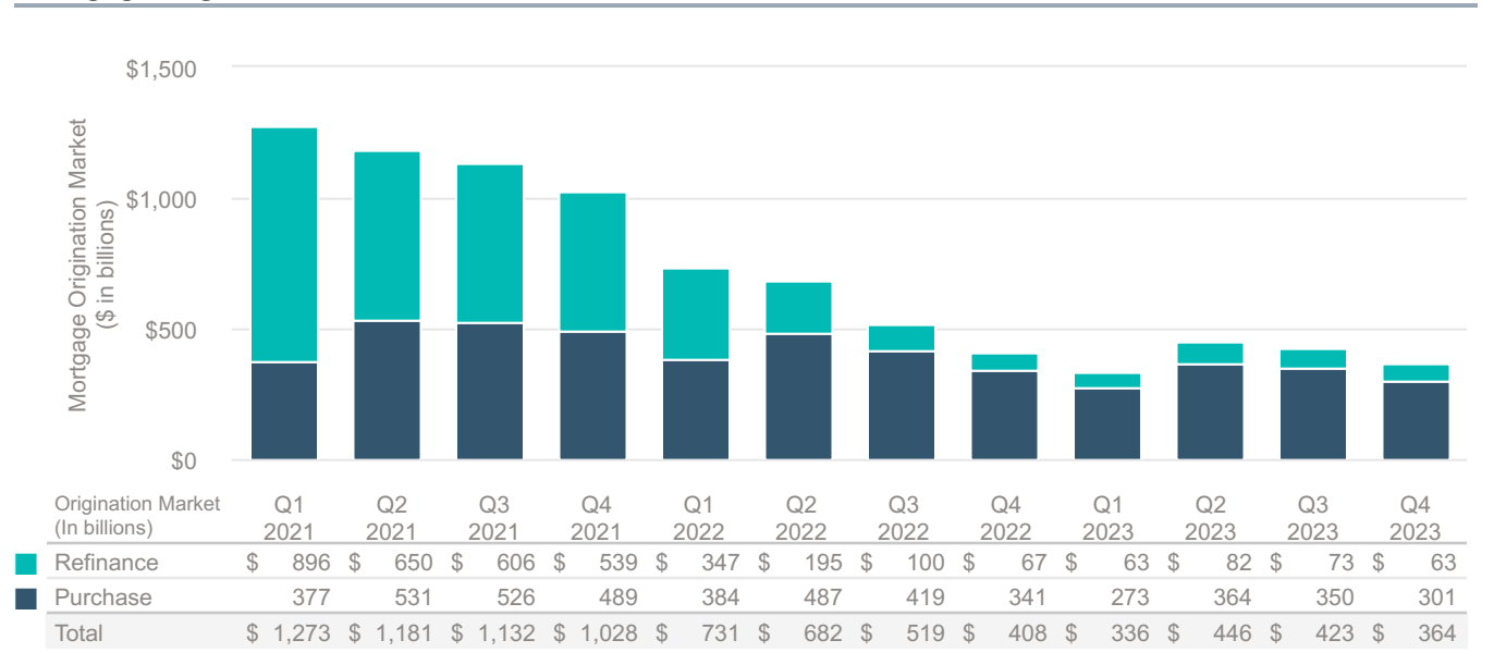
Private mortgage insurance penetration of mortgage origination market <sup>(1)</sup>